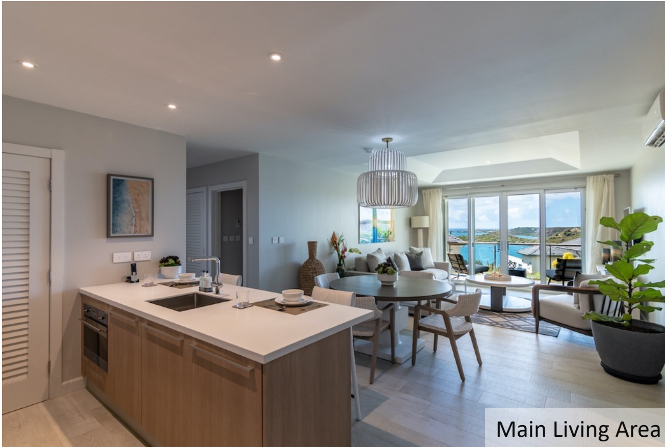
Main Living Area

2-bedroom / 2-bathroom luxury condo suite Location: Ground Floor, North Condo Block